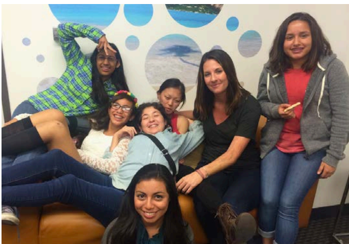
Smiles, laughter, and strength—our Support Group meetings help young survivors find joy on the journey to healing.

Children's Burn Foundation is honored to be the recipient of a generous $100,000 grant from The Colleagues, an organization dedicated to "philanthropy through fashion."