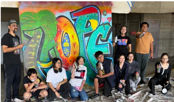
Teen burn survivors pose in front of their canvas of hope