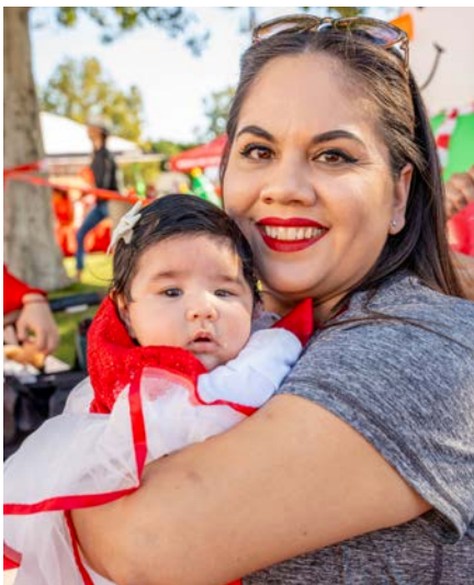
One of the celebration's youngest guests