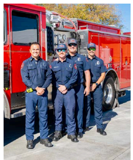
Burbank Fire Department members bringing cheer to the festivities