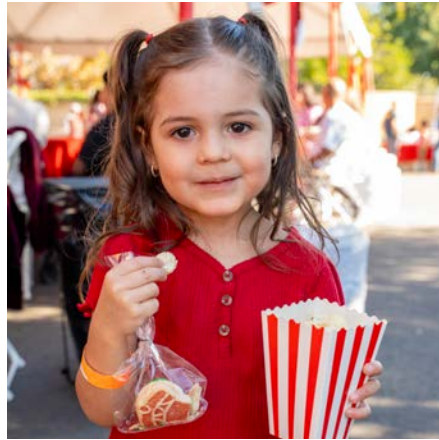
All smiles, snacks in hand, and ready for fun