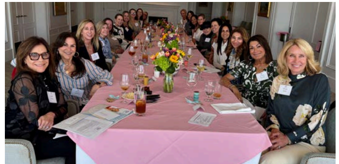
A wonderful afternoon learning about the inspiring work of the Council at the New Member Luncheon